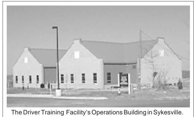
The Driver Training Facility's Operations Building in Sykesville.

Last year we made great strides in designing and funding portions of the new Training Center being constructed in Sykesville, with the Driver Training Facility due to begin routine operations in early Spring 1998. Design of the Firearms Training Facility, another part of the Training Center, began in 1997 with completion of construction targeted for Spring 1999. In addition, schematic design has started for the Center's administrative and academic complex.