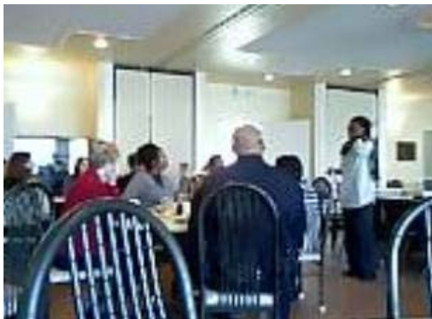
Pen Lucy Women's Breakfast, March 12, 2008

For more information on the programs mentioned please check out their web sites: Turn Around- www.turnaroundinc.org and the Marian House- www.marianhouse.org . Women Accepting Responsibility has no website but can be reached by calling (410) 947-0700.