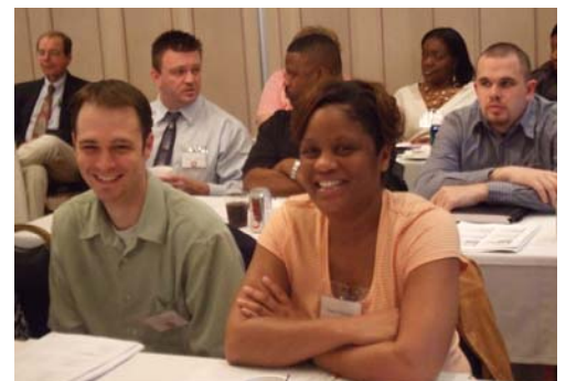
Spring Conference photo

The Spring Conference received great reviews. Thanks to all who participated.